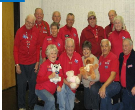
HOT members displaying a few of more than 200 toys . Way to Go HOT and the Texas W Club.