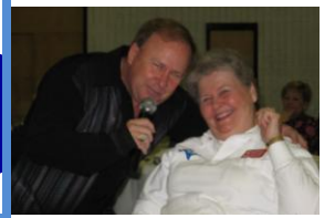
Mimi and The C