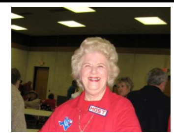
Happy Dorothy Parker says,