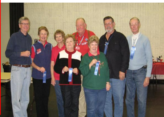
Bean Bag Baseball Winners.