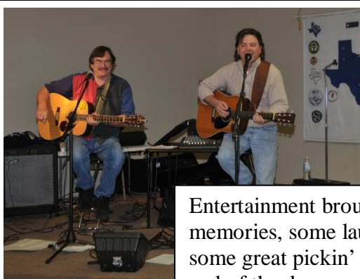
Entertainment brought some memories, some laughs and some great pickin' at the end of the day.